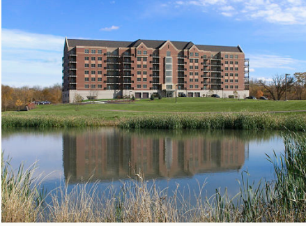
RIVERWALK APARTMENTS BUFFALO GROVE, IL 90 UNITS