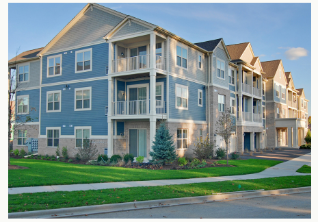
OAKS OF VERNON HILLS VERNON HILLS, IL 336 UNITS