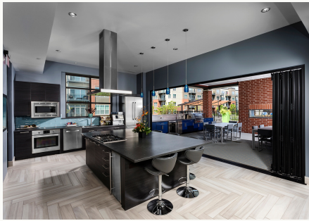
THE RESIDENCES AT HAMILTON LAKES, IL 297 UNITS