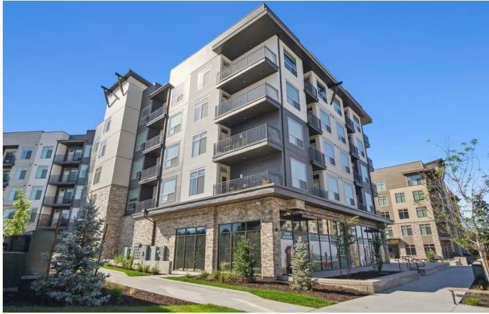
SEVEN SKIES LUXURY APARTMENTS SALT LAKE CITY, UT 305 UNITS