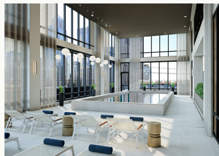
270 HENNEPIN MINNEAPOLIS, MN 340 UNITS