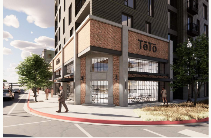
CINQ APARTMENTS SALT LAKE CITY, UT 203 UNITS (2 BUILDINGS)