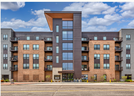
10 NORTH MAIN MOUNT PROSPECT, IL 98 UNITS