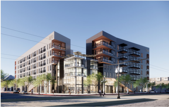
LUMA APARTMENTS SALT LAKE CITY, UT 205 UNITS