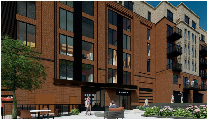
HQ RESIDENCES MOUNT PROSPECT, IL 88 UNITS & 6 TOWNHOMES