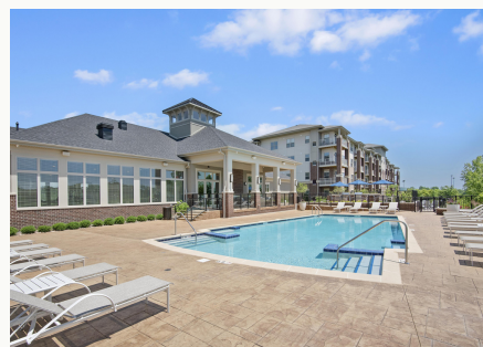
DEERPARK CROSSING DEERPARK, IL 236 UNITS