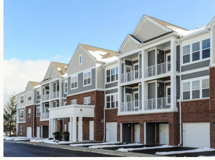
NORTHGATE CROSSING WHEELING, IL 288 UNITS