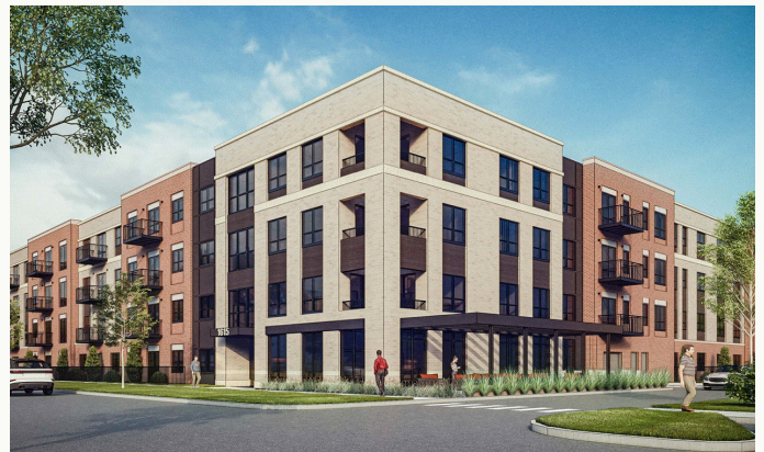
TBD CHECK BACK TO SEE WHERE WE ARE BUILDING NEXT!