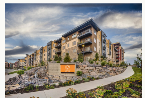
THE EAST VILLAGE SANDY, UT 336 UNITS