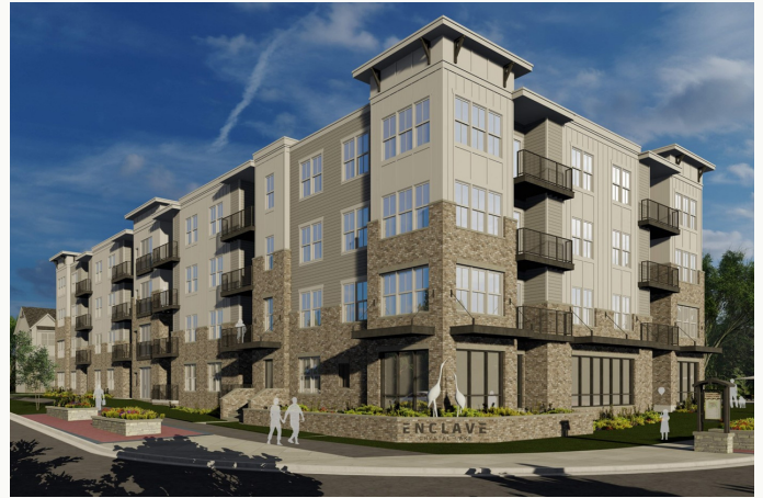
ENCLAVE CRYSTAL LAKE, IL 205 UNITS