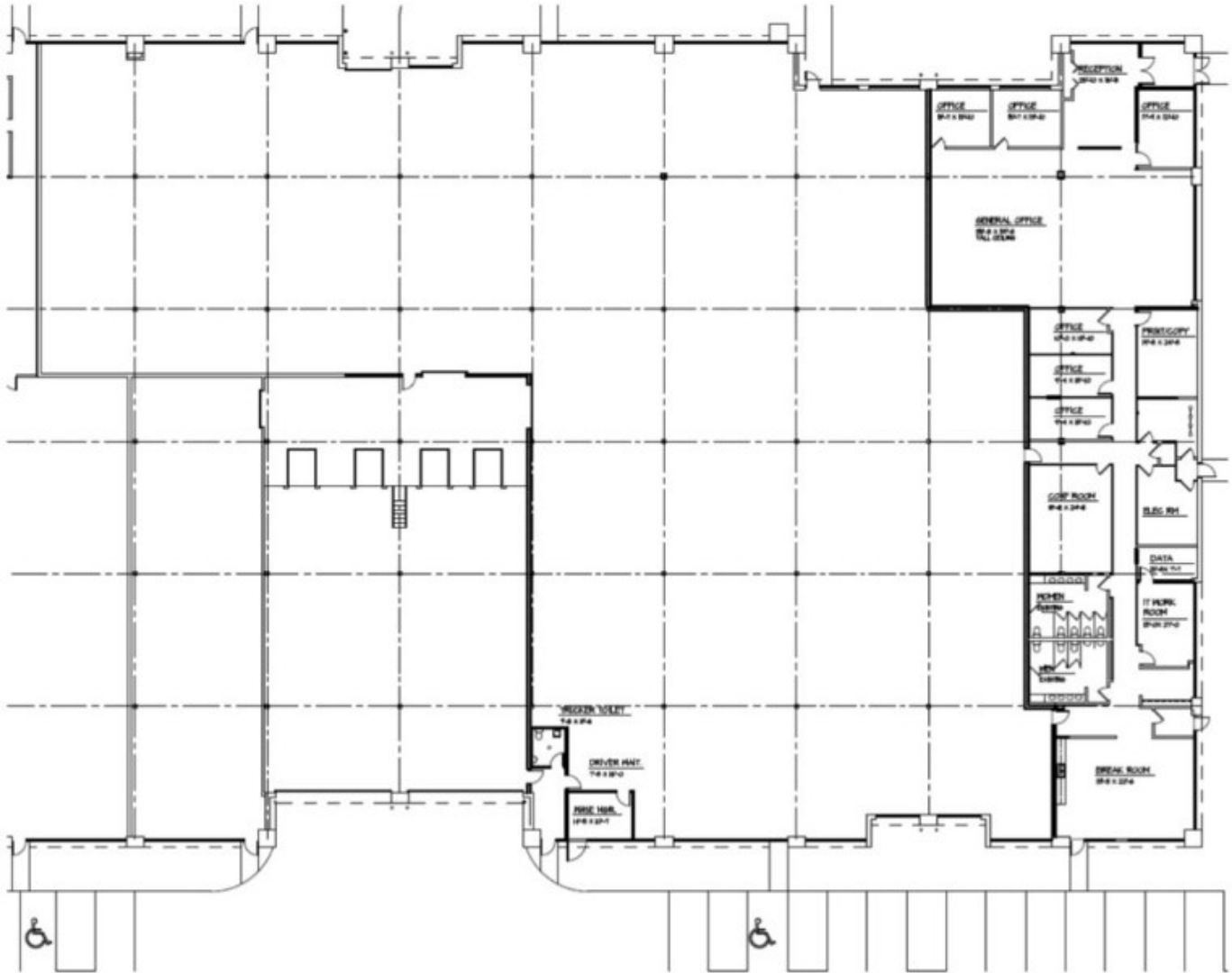
OVERALL FLOOR PLAN 5/1/2018 SCALE: 1/8" = 1'-0"

321 West Lake Street WLF B (Suite C) 321 W. Lake St Elmhurst, IL 60126