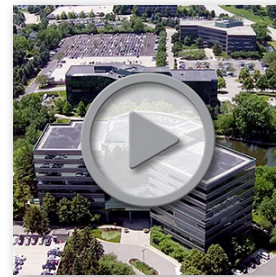
Arboretum Lakes Video